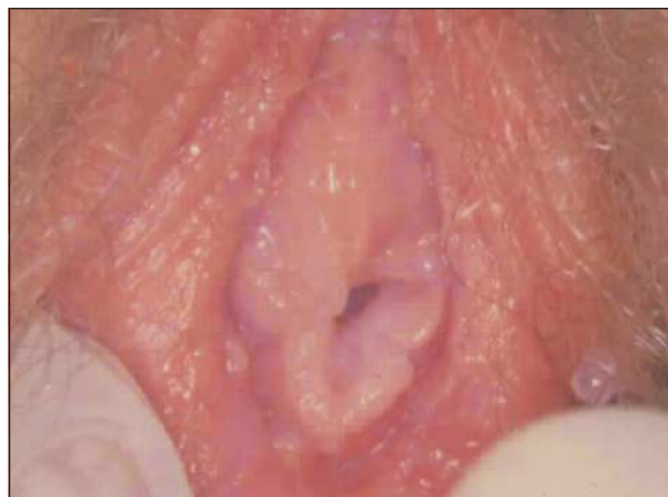
Figure 1. Photograph at \times 10 magnification, showing a 19-year-old subject who admits to having consensual intercourse. Any notches or clefts in the hymen are unable to be clearly seen in this view.

Because the examiner was able to manipulate the hymenal tissue during the examination and make nota-