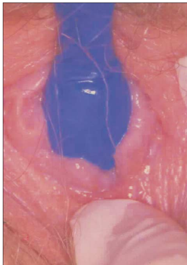
Figure 2. The same subject as in Figure 1. A large cotton swab covered with a small latex balloon was used for contrast. A complete cleft in the hymen at the 5-o'clock position is clearly demonstrated.

‡Deep notch refers to a defect extending through more than 50% of the width of the hymen; complete cleft, a defect extending all the way through the width of the hymen.