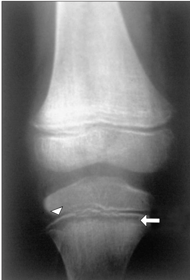
Figure 3. Knee radiographic scan shows a dense white line at the proximal end of the tibial metaphysis (arrowhead), with adjacent lucent band (arrow).

diffuse edema. 3 If left untreated, death may ensue from cerebral hemorrhage or hemopericardium. 11